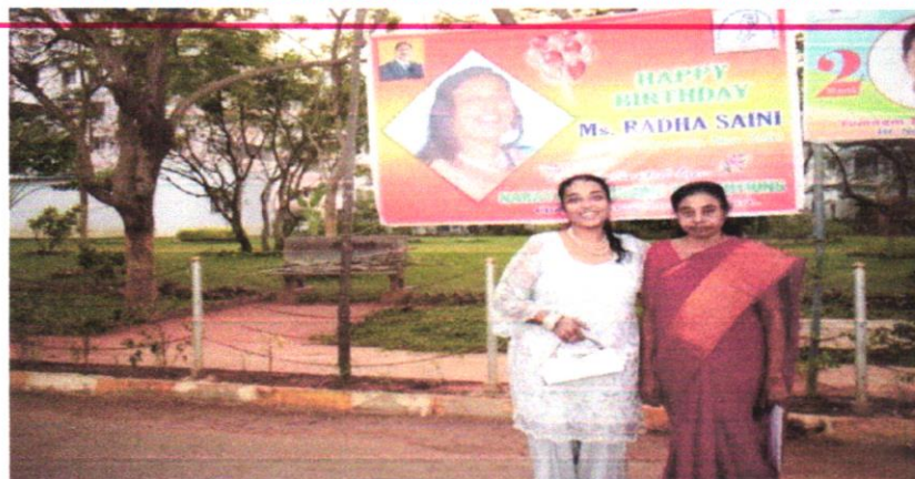
Fig- 4 Expressing gratitude

Recognized by Indian Nursing Council vide letter No. 18-916/2002/inc dated : 08.11.2002, Affiliated to NTR University of Health Sciences, A.P. Vijayawada e-mail : narayana_nursing@yahoo.co.in website : www.narayanannursingcollege.com