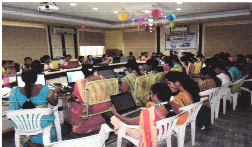
Fig -4 Actively involved in the workshop

Recognized by Indian Nursing Council vide letter No. 18-916/2002/inc dated : 08.11.2002, Affiliated to NTR University of Health Sciences, A.P. Vijayawada e-mail : narayana_nursing@yahoo.co.in website : www.narayanannursingcollege.com